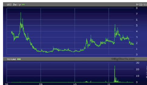
Daily Stock Chart: Price & Volume

Subsequently, the Company brought IR in-house to focus exclusively on oil and gas investors. Since then, the share price has dropped below $1.00.